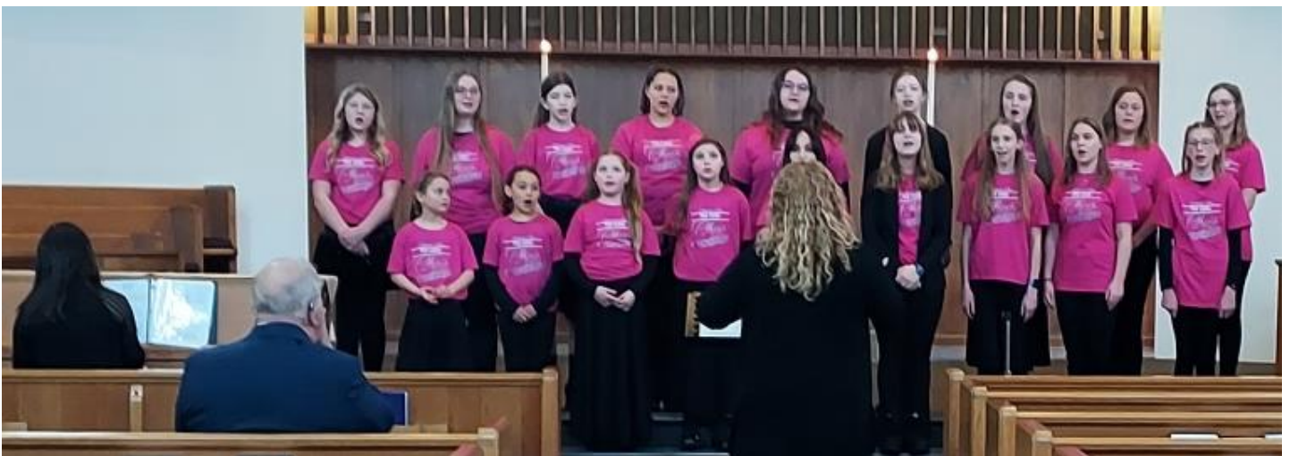
Below: Last month, the Pink Ladies honored us with their voices, their wonderful gift of music.